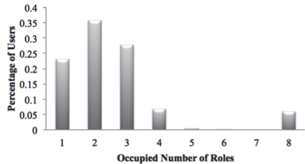
Figure 2: Distribution of Occupied Number of Roles.

We also represented how mixed editors are by computing a Gini coefficient based on how many roles an editor has