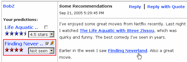
Figure 1. Forum post with two movie references.

One distinguishing feature of the MovieLens forums is its ability to recognize and understand references to movie titles in posts [7]. Recognized movies are hyperlinked and recommendation information is presented alongside the forums interface. Figure 1 shows a post with two linked references. Movie recognition enables several of the personalization algorithms described in this research below.