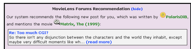
Figure 4. A sample invitation from the MovieLens home page during experiment 2. The post preview text is used with the author's permission.

Figure 4 shows a sample invitation. The most prominent visual change to the invitation design was the inclusion of the subject line of the recommended post, as well as up to 125 characters of preview post text. To avoid confounding our experimental manipulation, we stripped references to movies from the preview text. To do this in a natural way, we searched the post for the first phrase beginning with 125 characters without a movie reference. Failing this, we used the first 125 characters of the post, replacing movie titles with the string "...".