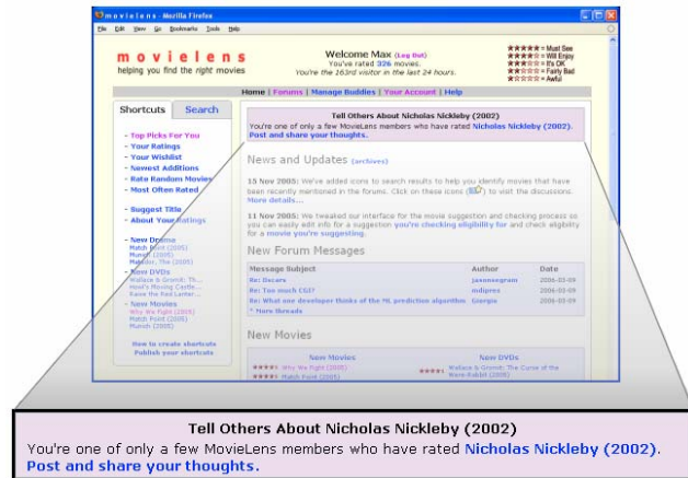
Figure 3. MovieLens home page with one of the invitation variants from experiment 1 (magnified).

Figure 3 shows an example of a personalized invitation on the MovieLens home page. The content selection algorithm ( Rare Rated , see below) has found a movie entity ( Nicholas Nickleby (2002) ) that the target user has rated, but that few other users have rated. The invitation suggests that the user start a new thread about this movie, stating that the user is “one of only a few” members who is able to take this action.